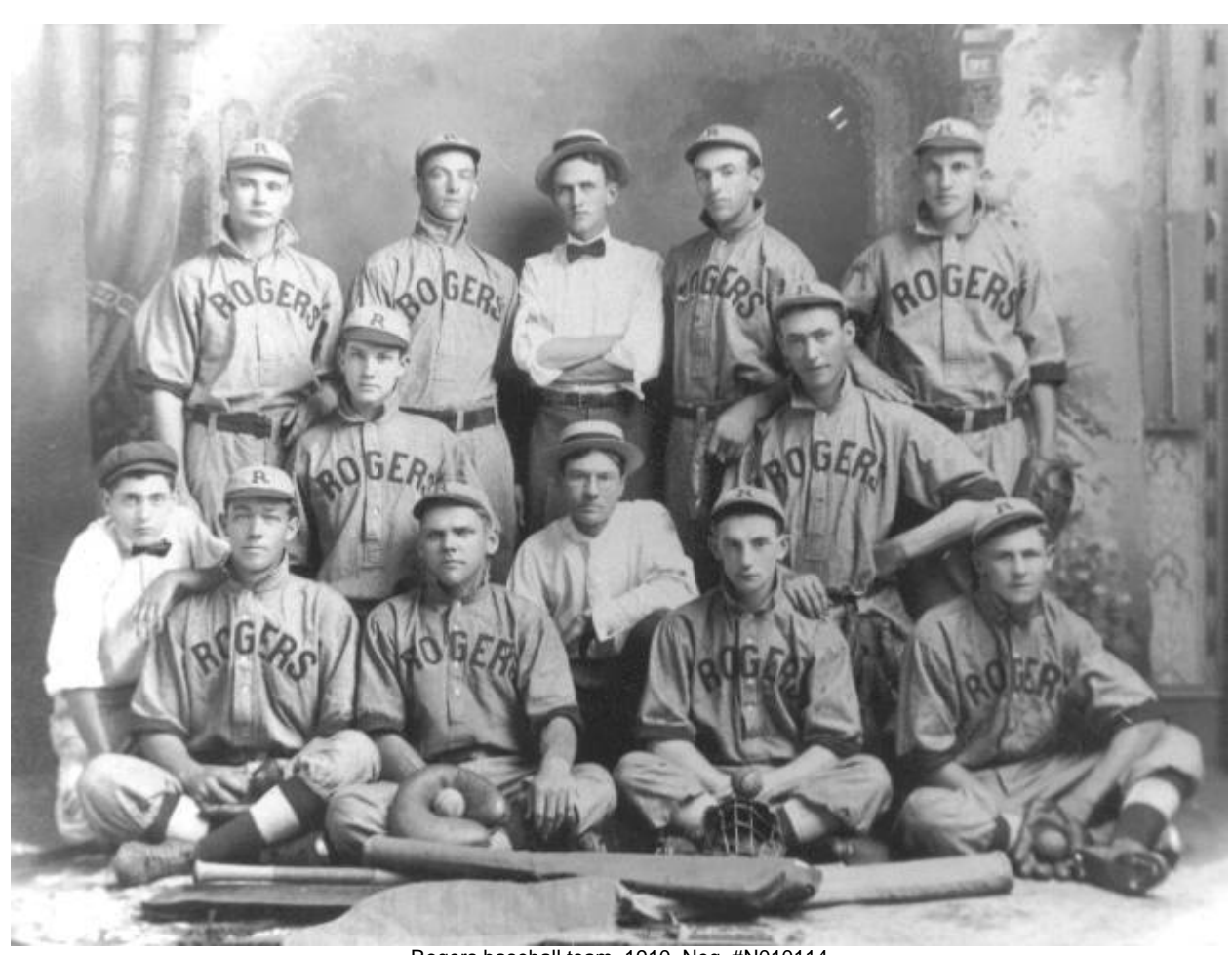
Rogers baseball team, 1910. Neg. #N010114