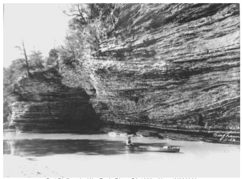
Red Bluff on the War Eagle River, CA 1920s. Neg. #N009000