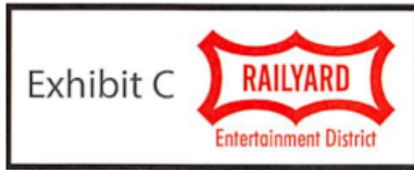
Sidewalk boundary decal